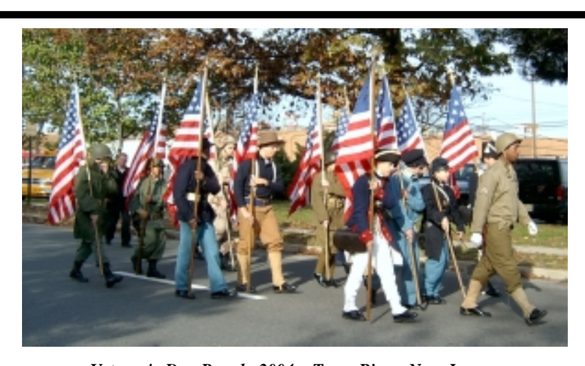
Veteran's Day Parade 2004 - Toms River, New Jersey A Lakewood, NJ contingent of "Soldiers" dressed in authentic uniforms dating back to the Revolutionary War Parades

Web Site: www.findacure.com E-mail:findacure@comcast.net